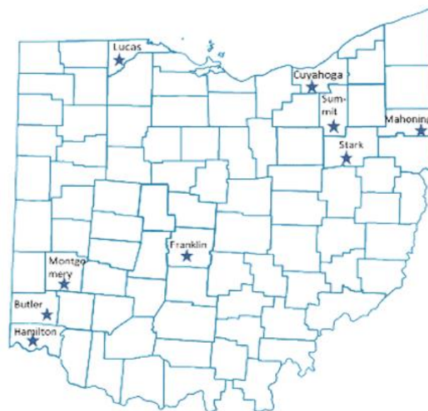
9 Ohio Equity Institute Counties

The 2016 OPAS, a stratified mixed-mode, random survey, collected information on the experiences and attitudes of all Ohio women approximately two to four months after delivery. Specific populations of interest, such as the nine Ohio Equity Institute (OEI) counties (as displayed in the map) were oversampled to facilitate analysis of the state’s initiatives and ongoing program development.